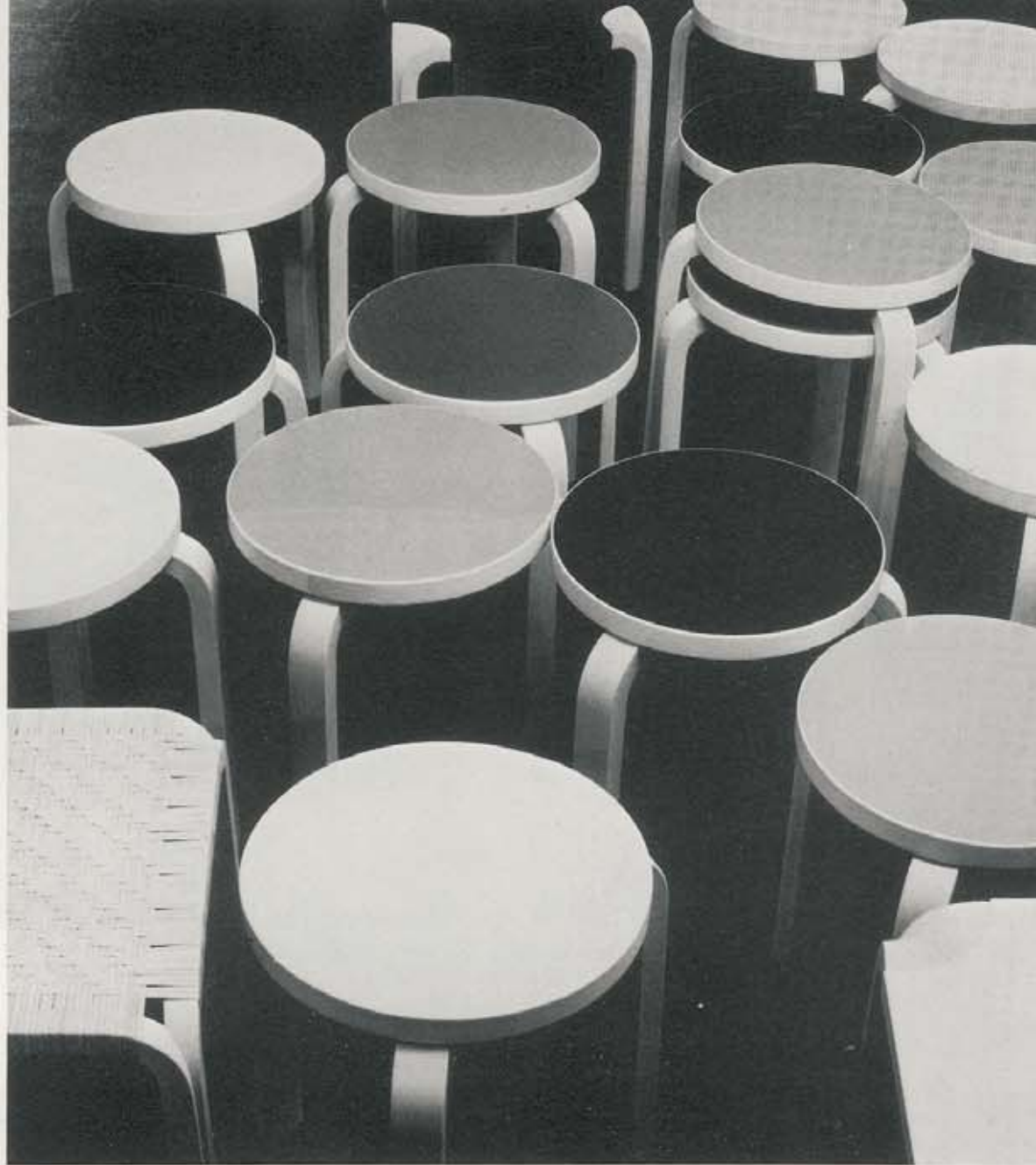
Bentwood stools and, below, table No 91 and armchair No 406, made from resilient bentwood with strong webbing upholstery. All designed by Alvar Aalto and marketed through ARTEK OY AB

The firm ARTEK OY AB was originally formed to manufacture and market the furniture designed by the architect Alvar Aalto more than a quarter-of-a-century ago. Aalto's furniture, using the principle of steam-pressed laminated wood, combines a large degree of standardization with classically simple shapes. Furniture he designed thirty years ago is still being manufactured, and today it looks as modern as any on the international market. From time to time additions are made to the ARTEK range of furniture, but by and large the collection remains as first conceived by Alvar Aalto.