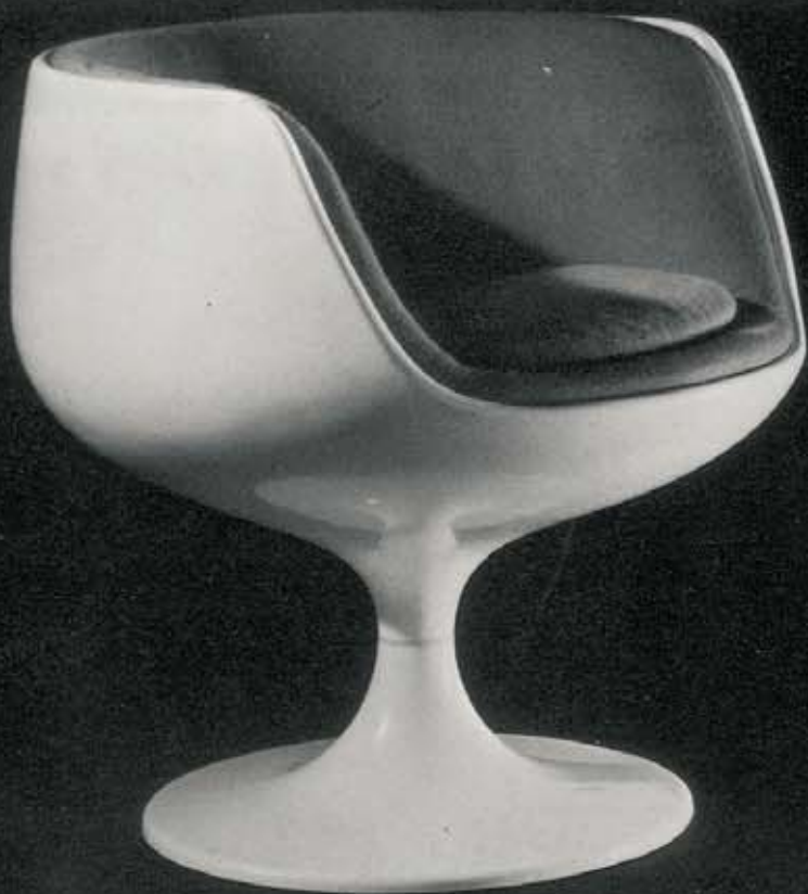
'V S O P' chair and 'Kantarelli' table in glass-fibre. The chair has foam-rubber padding. Designed by Eero Aarnio for ASKO.